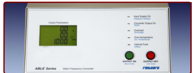
A digital display shows the output voltage and current.

An advanced front-end design ensures a robust input section able to withstand voltage swings and transients without damage. A power factor correction circuits also helps to improve the input power factor.